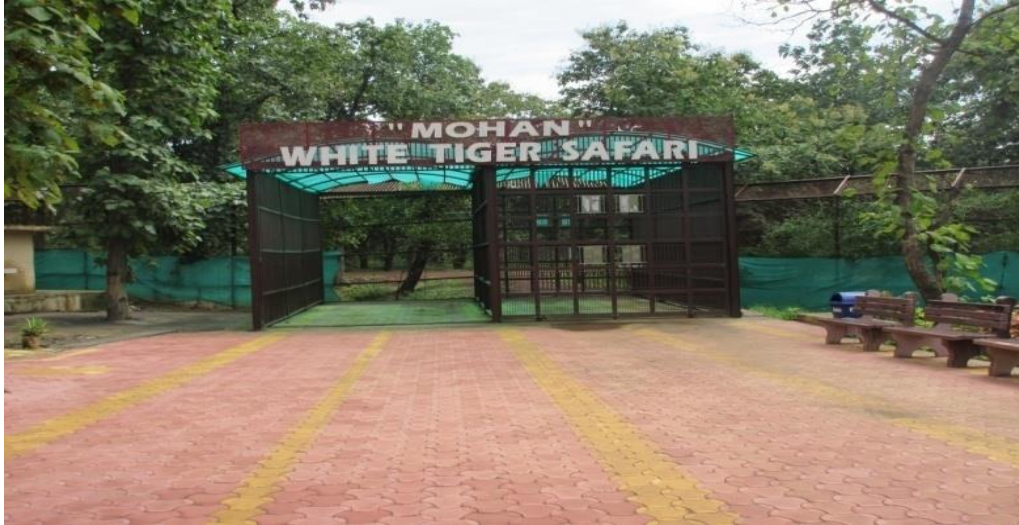
Exhibit Gallery- The entire tale of white tiger from its first reporting in the region till the recent status, everything is depicted through beautiful pictures and write-ups in the exhibit gallery. It is appreciated and liked by the visitors.

White Tiger Safari : A white tiger safari established in April 2016 spreads over an area of 25 ha in natural surroundings. It provides a unique experience to the visitors where they get a chance to see the white tiger roaming freely in the natural environment.